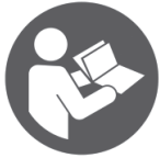
Refer to instructions

IMPORTANT: PLEASE READ THESE INSTRUCTIONS CAREFULLY. NOTE THE SAFE OPERATIONAL REQUIREMENTS, WARNINGS & CAUTIONS. USE THE PRODUCT CORRECTLY AND WITH CARE FOR THE PURPOSE FOR WHICH IT IS INTENDED. FAILURE TO DO SO MAY CAUSE DAMAGE AND/OR PERSONAL INJURY AND WILL INVALIDATE THE WARRANTY. KEEP THESE INSTRUCTIONS SAFE FOR FUTURE USE.